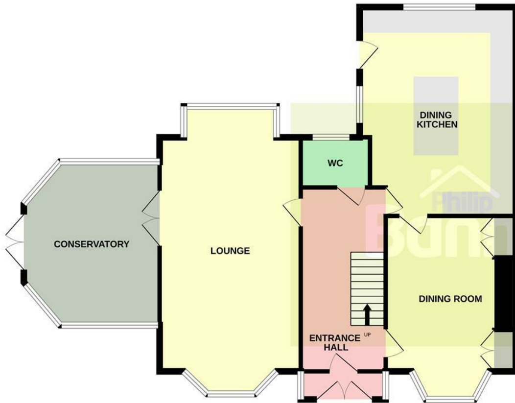
GROUND FLOOR 1054 sq.ft. (98.0 sq.m.) approx.